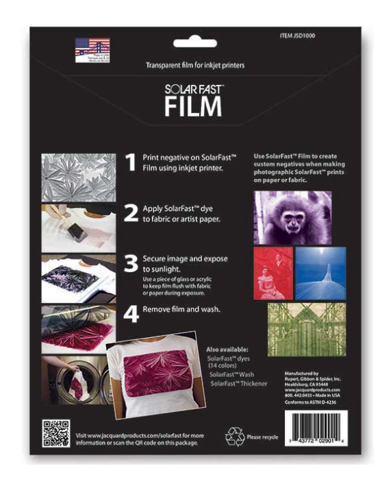
SolarFast™ Film, front and back