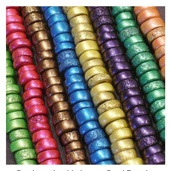
Beads made with the new Pearl Ex colors by <u>Carolyn Hasenfratz</u>

Jacquard Pearl Ex is a safe, pearlescent, non-toxic, inert, powdered mica pigment that exhibits extreme colorfastness and stability, ideal for interior and archival applications. It has a use for every artist, from watercolorist to auto painter, faux finisher to rubber stamper. Try it mixed with Jacquard Gum Arabic or Pearl Ex Varnish for applying to most surfaces. It can also be mixed with other artist mediums, oils, acrylics, encaustic, Dorland's Wax, polymer clay, or spread dry on porous