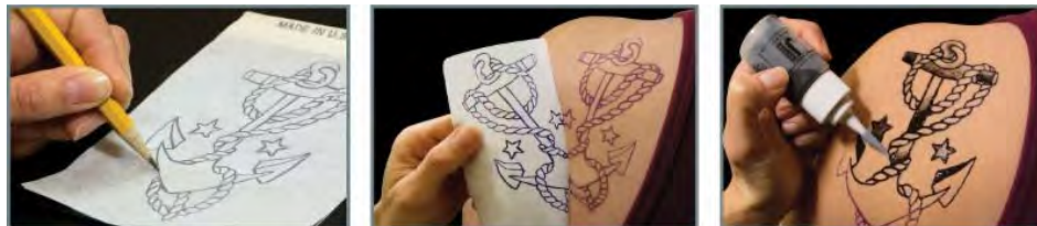
Use the provided Transfer Paper for easy tracing of custom designs or freehand draw directly onto the skin