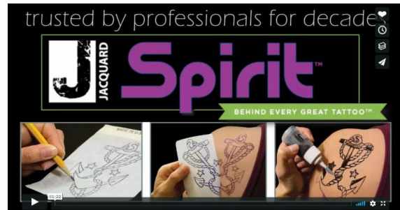
VIDEO - Body Art Transfer Paper / Jacquard Spirit Paper

Body art made with henna and jagua lasts a long time (up to two weeks) and creating new designs directly on the skin can be nerve-racking. Body Art Transfer Paper can provide peace of mind! It is especially useful for transposing designs from paper (a sketchbook, magazine or computer screen, for instance) to the skin and imagining designs on the contours of the body.