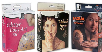
Body Art Kits

Check out ALL of Jacquard's Body Art products: