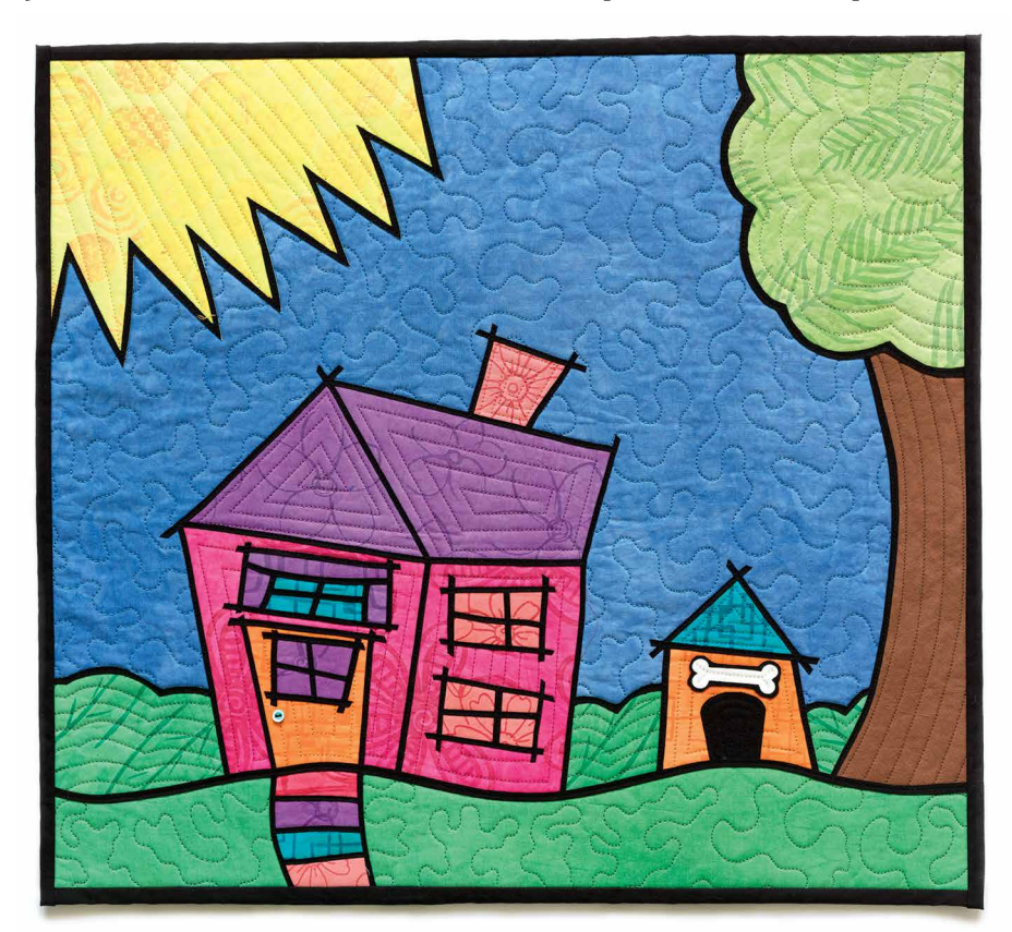
"Little Pink House" • 18" x 20" • Made with Jacquard Color Magnet and Procion MX dyes.

1. Pour approximately ½ cup of warm water in the container and add ¼—½ tsp. of dye powder. Screw the lid on tightly and shake it well to dissolve the dye powder. Open the container and add enough warm water to bring it to the 1 cup level and add 1 tbsp. of soda