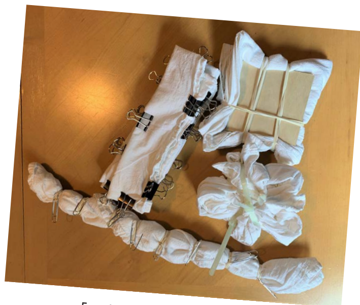
Four folding techniques I practiced in preparation for teaching my friends.

Set each seat with a pair of gloves (have a latex-free option available) and 2-4 pre-washed and folded tea towels.