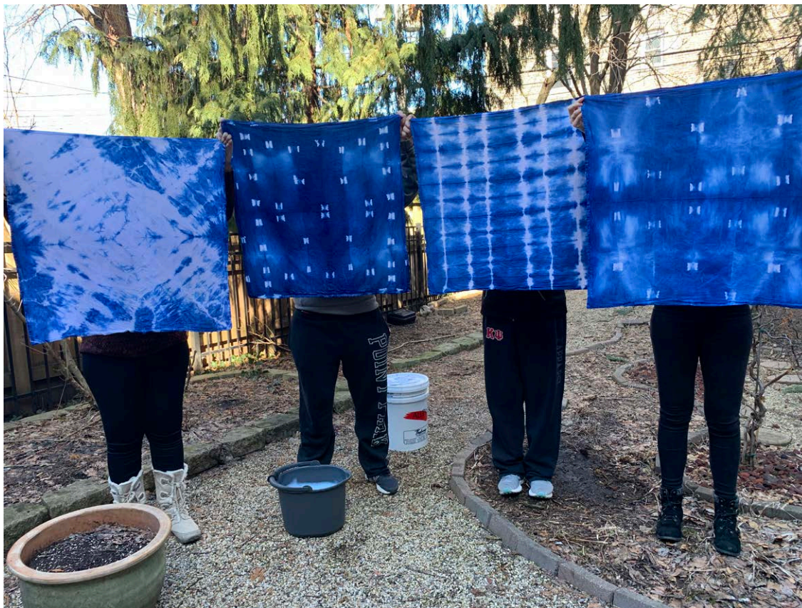
Art Supply Enterprises licenses the above content, "Shibori Tea Towels With Jacquard Indigo Dye," to its partners & affiliates under the Creative Commons Attribution-NoDerivatives 4.0 International License. All uses of this content should include the following attribution: "Shibori Tea Towels With Jacquard Indigo Dye" by Art Supply Enterprises is licensed under CC BY-ND 4.0

Allow your friends to bring jeans, t-shirts, or anything to dip. You will have extra dye if you have less than 15 people attending.