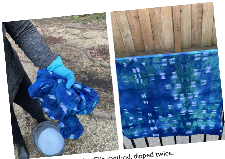
Binder Clip method, dipped twice.