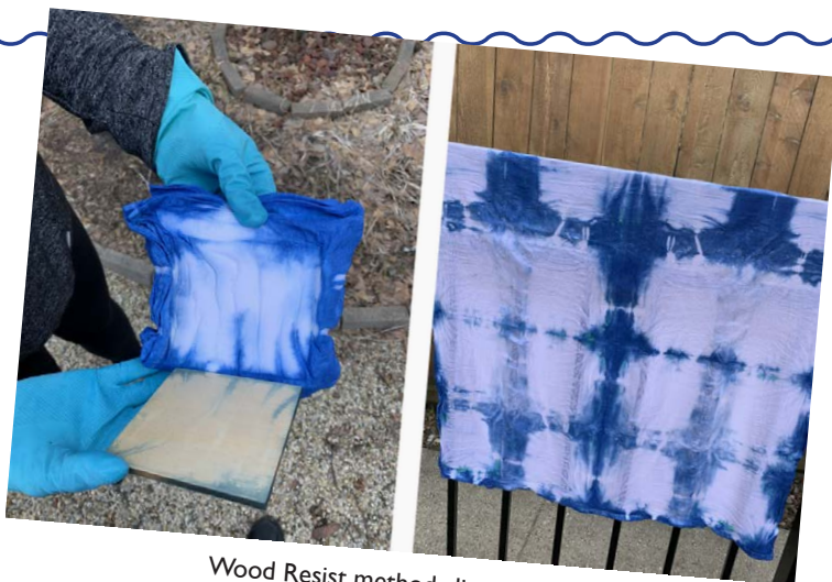
Wood Resist method, dipped twice.

STEP 6: Once all pieces are dyed and rinsed, take off binding to reveal the pattern.