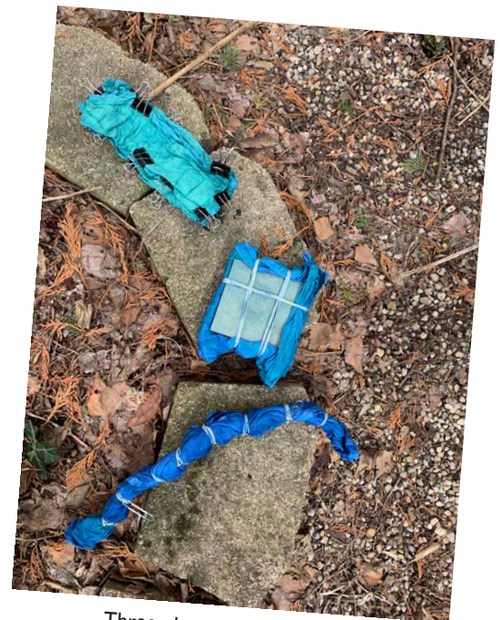
Three phases of oxidization. Top item is most recently dyed.

STEP 4B: Once color deepens, re-dip your fabric in dye if you want a darker color. You can dip your fabric as many times as you wish until the desired depth of color is achieved.