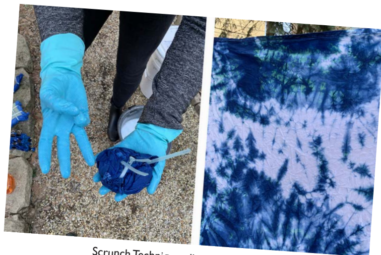
Scrunch Technique, dipped three times.