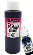
Piñata Alcohol Inks Canadian-compliant labeling now available (1/2 fl oz & 4 fl oz)