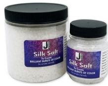
Silk Salt New label design & new clear container (10 oz size)