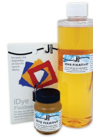
iDye Fixative New label design (2 sizes)

— Replacing translucent 1 quart jars for Dyes and Textile Color paint