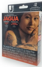
Jagua Kit (2T) Bilingual packaging now available (English / French)

— Replacing translucent 1 quart jars for Dyes and Textile Color paint