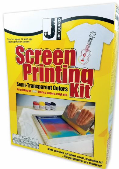
Jacquard Professional Semi-Transparent Screen Ink Kit Item JSI9000

Screen Printing Kits with Semi-Transparent and Opaque ink options!