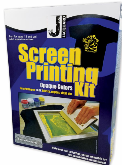
Jacquard Professional Opaque Screen Ink Kit Item JSI9001

Included Ink Colors: Opaque Blue, Opaque Red, Opaque Yellow & Super Opaque White