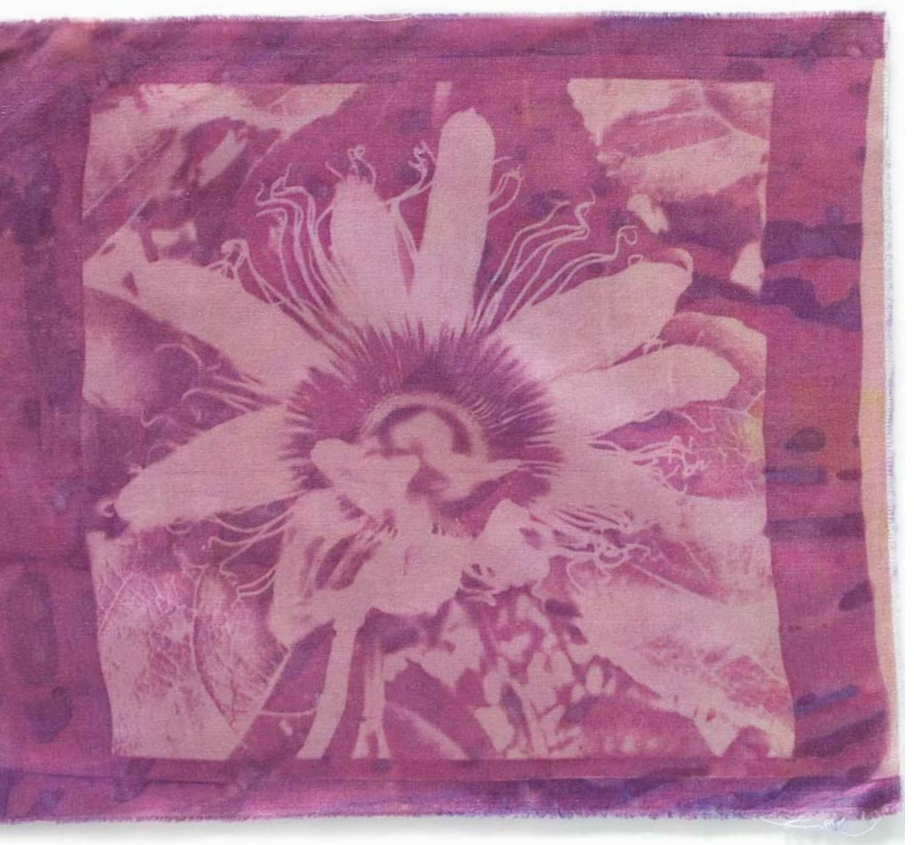
This image of a lilikoi flower was made from a photo and dyed onto fabric using SolarFast.

love to experiment with different dyes and the effects that can be achieved. As soon as I discover a new product or dye process, I'm quick to try it. SolarFast from Jacquard is a product that is activated by exposure to the sun. The quick development time for this dye (10–24 minutes) encourages experimentation and I find I can play with several methods in one day. The technique that excited me the most was printing photo negatives onto fabric. I also experimented with shadow printing and resist dyeing. You, too, can take advantage of the next sunny day to create new fabric.