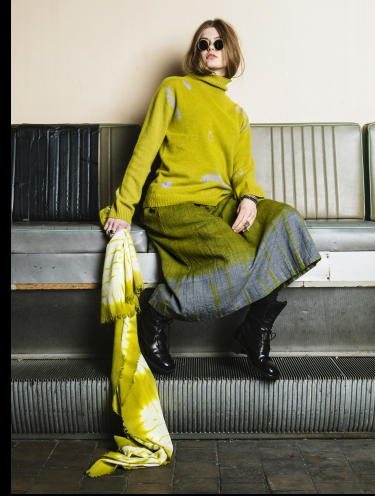
Dyed fashion by Hiroyuki Murase @suzusan_official