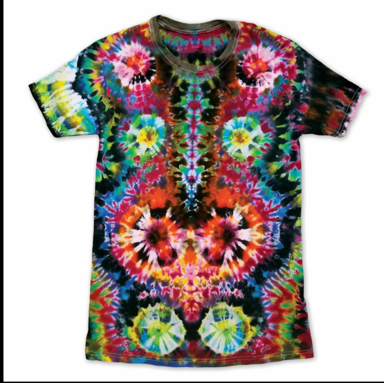
Tie dyed fashion by Tawny Frederickson @tawnosaurus