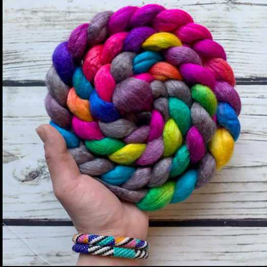
"After the Storm" by Lindsey Buccì @ReservoirFibers