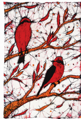
"Saca tu real (Cardenal Mosquetero)" by Ikaro Batik @ikarobatik